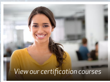
View our certification courses

“The course was great. The instructor is true Kubernetes Ninja. Loved the hands on approach. Very happy with the course.” Using Docker & Kubernetes in Production Oct '18”